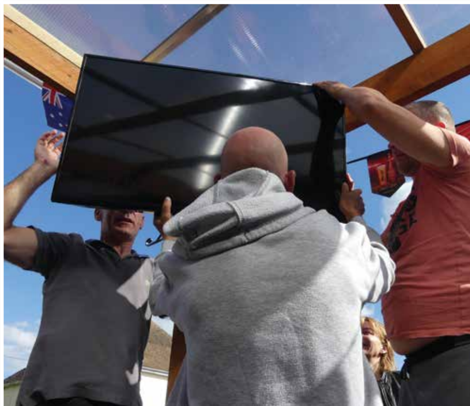
World Cup preparation at The Village Swan